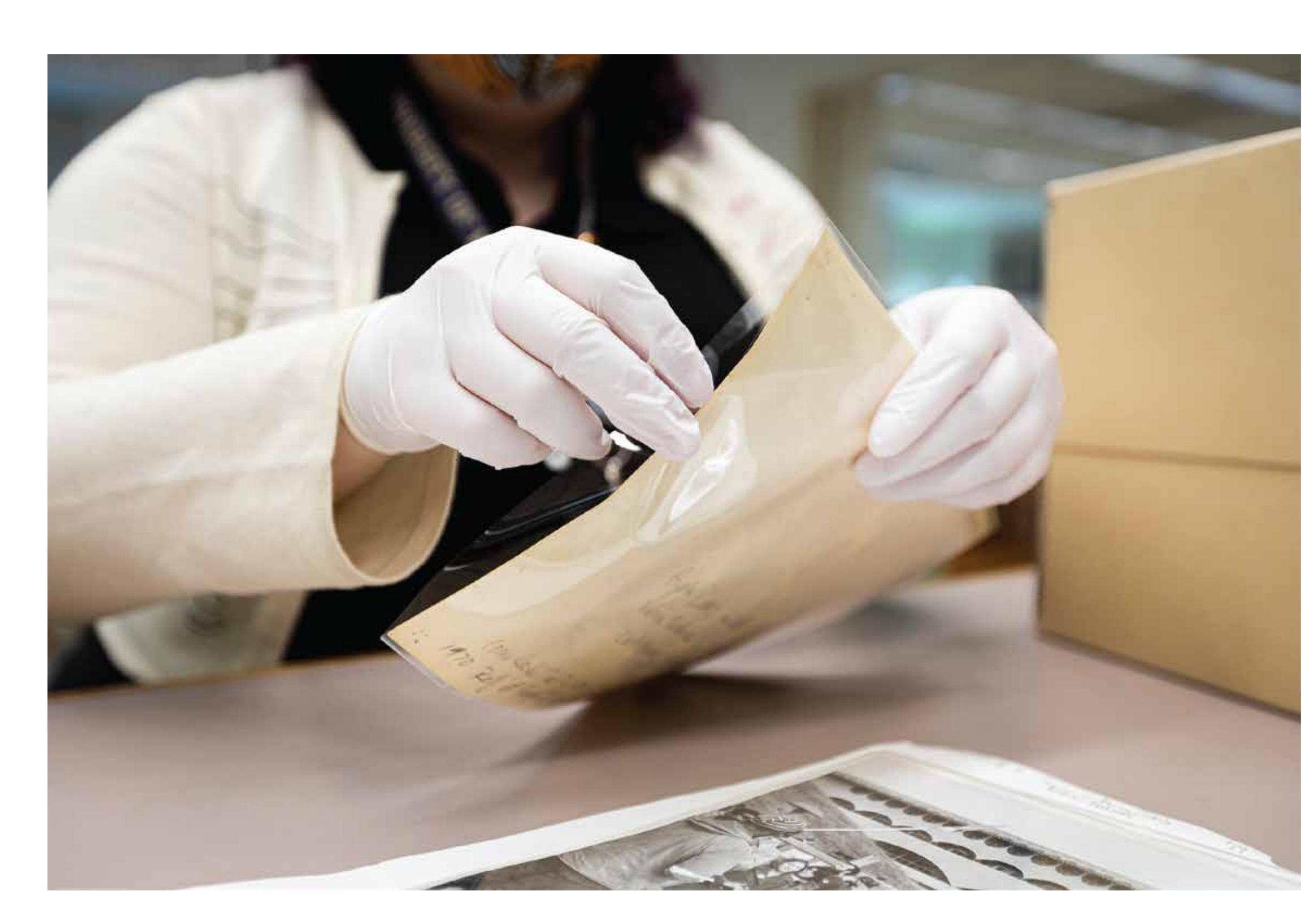
PRESERVATION: The UW houses museum specimens and documents that must be kept in a humidity and temperature-controlled environment to minimize deterioration.

The Seattle campus houses ice cores from Antarctica and other vulnerable specimens that must be kept continually frozen to preserve their research value.