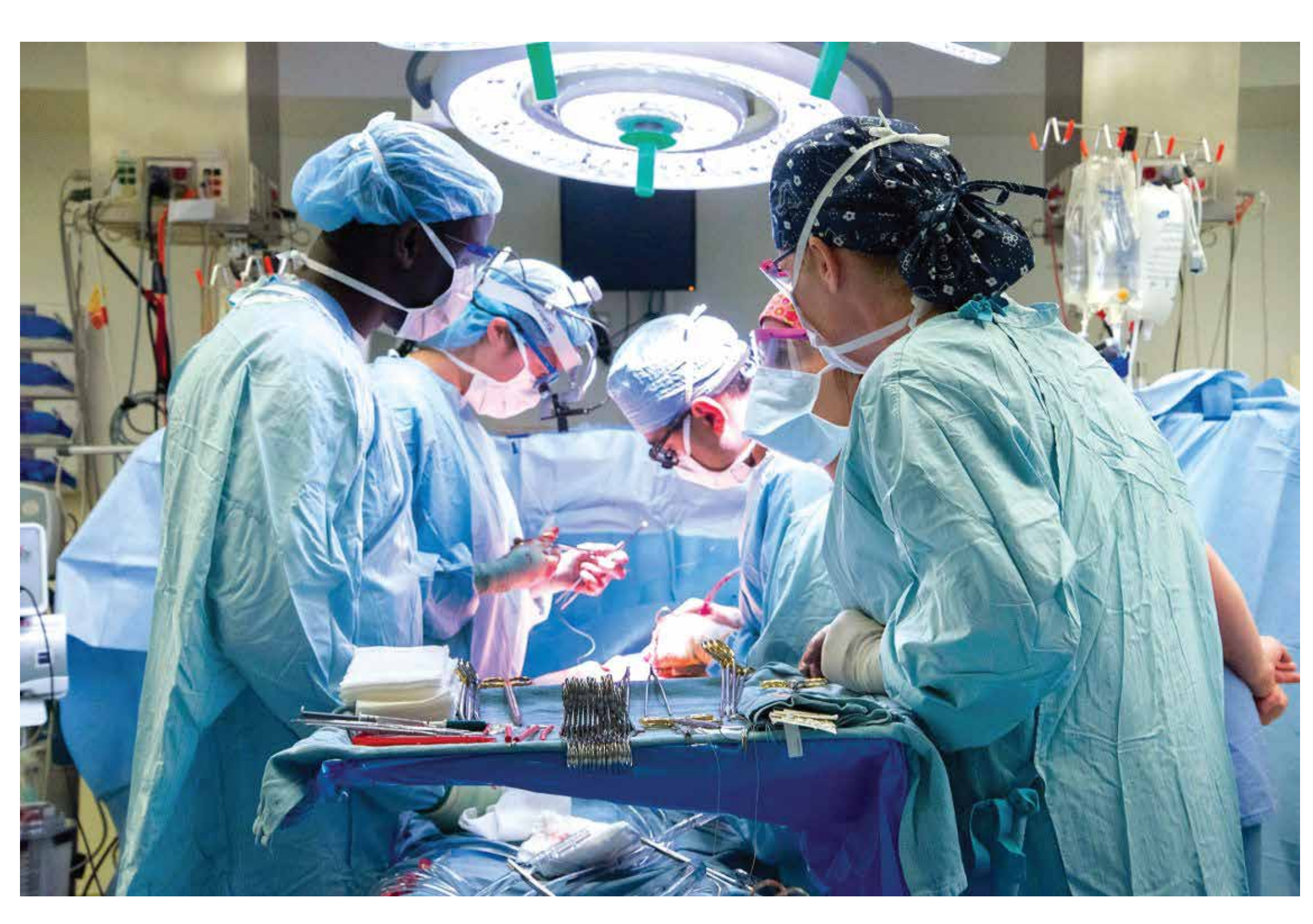
PATIENT CARE: Medical care relies on reliable electricity to operate delicate equipment; a well-functioning air-handling system for comfort and safety; and steam for sterilization.

Highly sensitive electronic equipment relies on a reliable power supply with minimal voltage fluctuations.