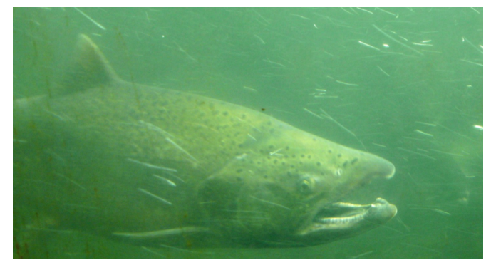
NOAA photo of Chinook Salmon in Ballard Locks

Sewer Heat Recovery: One of the sources of waste heat is in the major sewer lines that run along the east and south edges of campus. Every day over 7 million gallons of sewage flows within 50 feet of the Central Power Plant and almost 10 million gallons flows within 100 feet of the West Campus Utility Plant. The available energy in this sewage is enough to supply 20% of the heat we need to keep our buildings warm and hot water running from our faucets and showerheads.